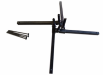
Cluster Flag Stand